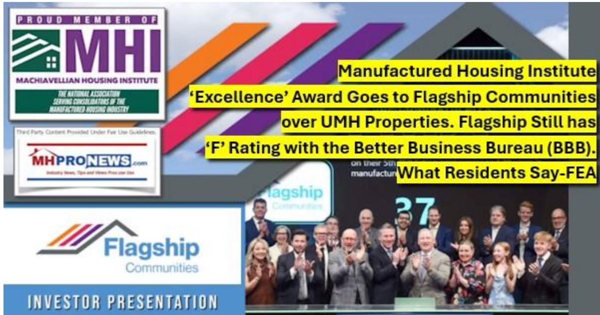
https://www.manufacturedhomepronews.com/flagship-ir-brags-new-supply-constraints-scarcity-of-land-zoned-for-manufactured-housing-municipal-govts-prefer-multi-family-and-single-family-developments-understanding-mhi-behavior-fea/ [/caption][caption id="attachment_218963" align="aligncenter" width="600"]