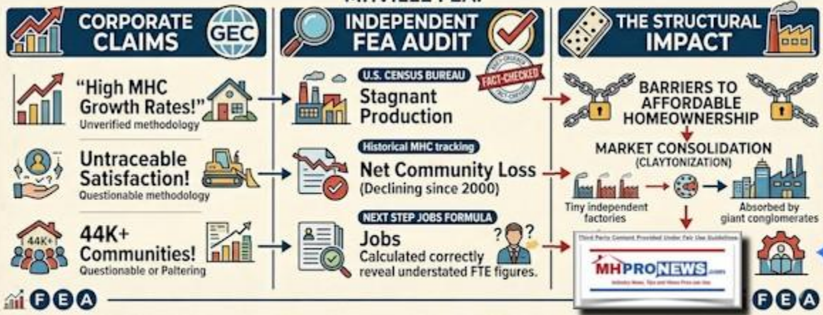
https://www.manufacturedhomepronews.com/factual-state-of-manufactured-housing-manufactured-home-industry-data-at-a-glance-with-sources-third-party-fact-checked-manufactured-housing-industry-infographics-mhville-fea/ [/caption][caption id="attachment_232417" align="aligncenter" width="600"]

THIRD-PARTY FACT CHECKED MANUFACTURED HOUSING INDUSTRY INFOGRAPHICS. MHVILLE FEA.