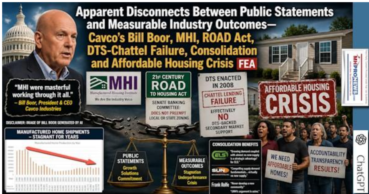
https://www.manufacturedhomepronews.com/apparent-disconnects-between-public-statements-and-measurable-industry-outcomes-cavcos-bill-boor-mhi-road-act-dts-chattel-failure-consolidation-and-affordable-housing-crisis/ [/caption][caption id="attachment_216406" align="aligncenter" width="647"]