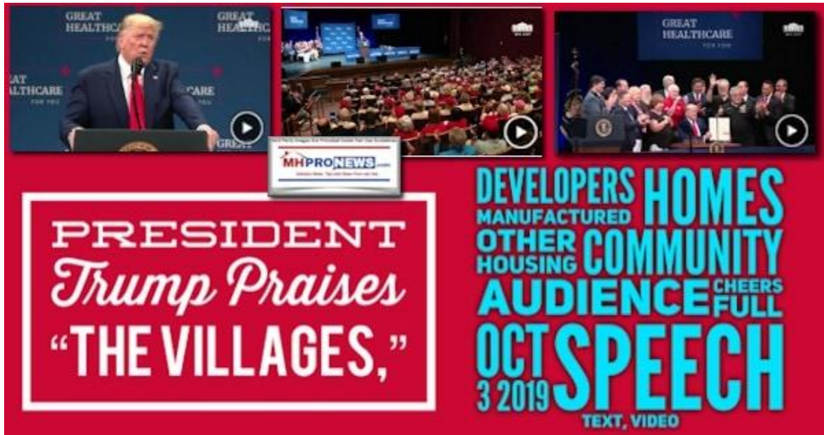
https://www.manufacturedhomepronews.com/president-trump-praises-the-villages-developers-manufactured-homes-other-housing-land-lease-community-audience-cheers-full-oct-3-2019-speech-text-video/ [/caption][caption id="attachment_129009" align="aligncenter" width="600"]