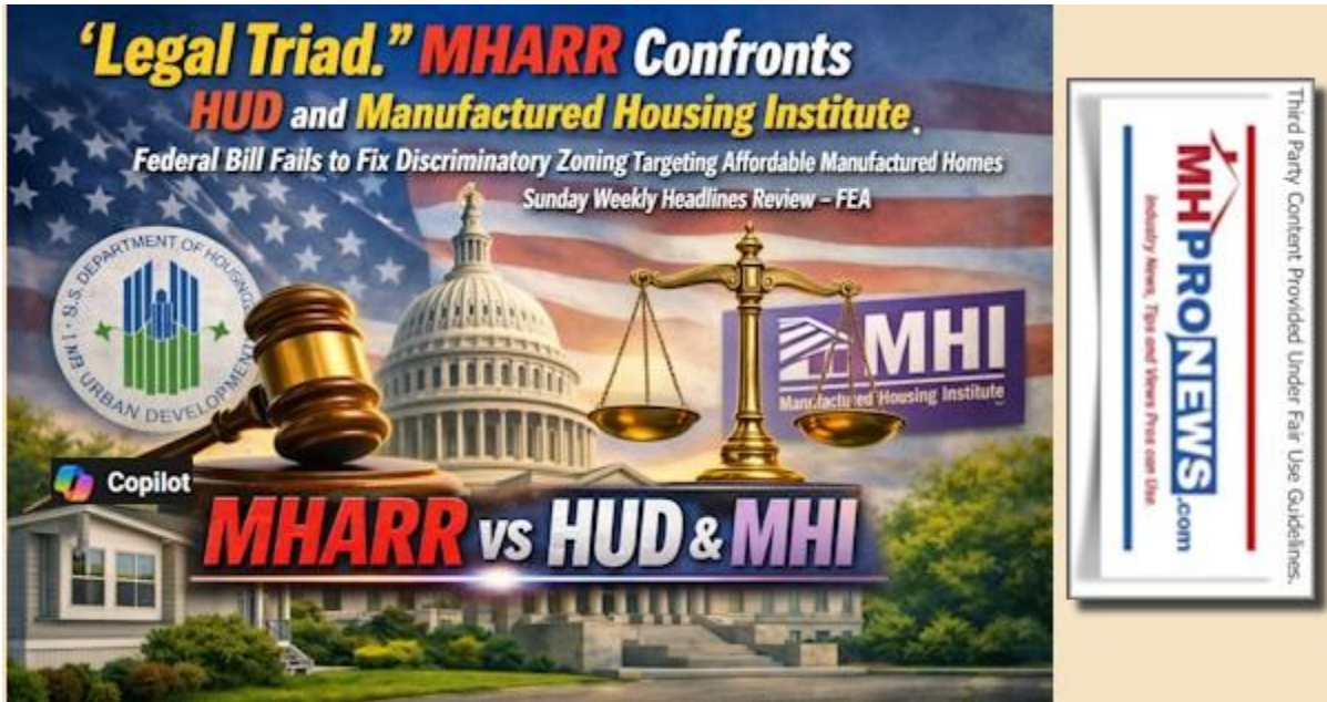
https://www.manufacturedhomepronews.com/legal-triad-mharr-confronts-hud-and-manufactured-housing-institute-federal-bill-fails-to-fix-discriminatory-zoning-targeting-affordable-manufactured-homes-sunday-weekly-headlines-review-fea/ [/caption][caption id="attachment_230037" align="aligncenter" width="600"]