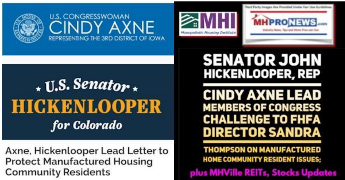
[caption id="attachment_181607" align="aligncenter" width="600"]