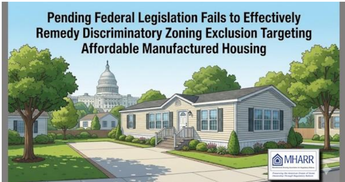
https://manufacturedhousingassociationregulatoryreform.org/pending-federal-legislation-fails-to-effectively-remedy-discriminatory-zoning-exclusion-targeting-affordable-manufactured-housing/ [caption id="attachment_231820" align="aligncenter" width="600"]