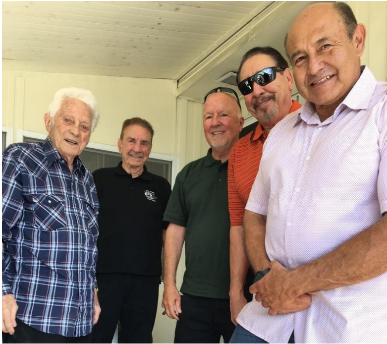
Rep. Correa stands alongside impacted veterans in Anaheim, CA

AVAG also provides charitable, community-based programs such as food drives, home improvement resources, furniture distributions, clothing donations, referrals to career training and VA benefits, as well as recreation opportunities within AVAG's mobile home communities. The more than 600 veterans living within the 40 VAHP related communities creates a substantial veteran network and adds to the support and information available on services ranging from healthcare to training and education and more.