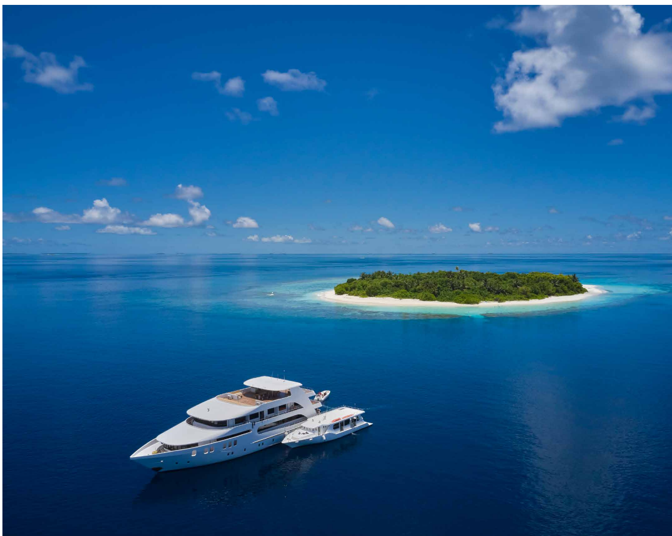
Aerial view of a luxury dive boat in the Maldives.

A more equal world is possible if governments effectively regulate and reimagine the private sector.