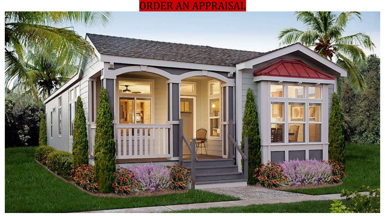
New Home MSRV

Your success depends on making solid lending decisions. That means you need reliable facts and accurate reports from a trusted source. Every appraisal is carefully reviewed against customer instruction and underwriting guidelines.