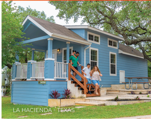
LA HACIENDA - TEXAS