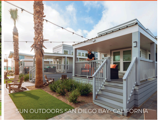
SUN OUTDOORS SAN DIEGO BAY - CALIFORNIA