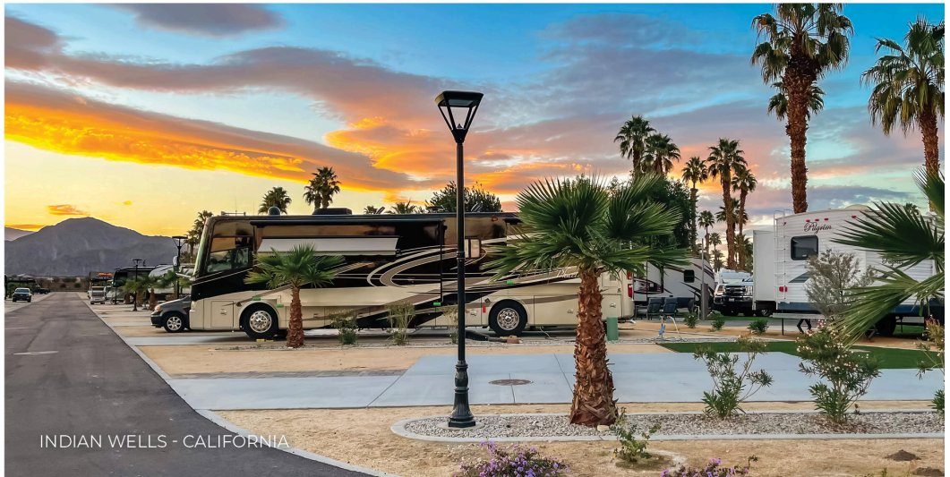
INDIAN WELLS - CALIFORNIA