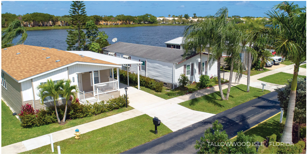
TALLOWOOD ISLE - FLORIDA